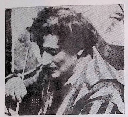
מארק שאגאל אין די יונגע יארן

זיין אופאַסונג פון דעם מענטשן, וועלכע איז דורכגענומען סיי מיט אַן אַלנאציאָנאַלן קאָלאָריט, סיי מיט יידישן טכום־האָמוישעוודיקן און ביבלישן קאָלאָריט. וועלן מיט דער צייט כאַהאַנדלען און באַטראַכטן פֿילאָסאָפן און סאָציאָלאָגן : ער האט, ערשטנס, באַוויזן, אַז מע דאַרף ניט זיין קיין אויבערפלעכלעכער מאַטעריאַליסט, קעדיי ניט מוירע צו האָבן פאַר דער פּעסט פון אידעאַליזם באַם אויסדיכטן אינעם מענטשן אומגלייבלעכע אייגנשאַפטן און מעגלעכקייטן, אָן אַ פאַרדאַכט, אַז דאָס וועט צוגעשריכן ווערן דעם ריכוינעשעלוילעם. אַזוי־ ארום. קומען מיר נאָכאַמאָל צום פאַרשטאַנד, אַז קונסט הּאָט ניט קיין ״פּאָטאַלאָק״., פּונקט אזוי ווי דער קאָסמאָס, פונקט אַזרי ווי דער מענטש אין אים. דער ״מעשוגאַס ״ אין <sup>פ</sup>ונקט פֿאָעזיע, אין מאָלעריי אדג. איז יענע שליימעסדיקע "רַאַּךְ". אפן "דאַךְ". מאַכט אָן אָרט פאַרן "פידלער" אפן Jewish Affairs