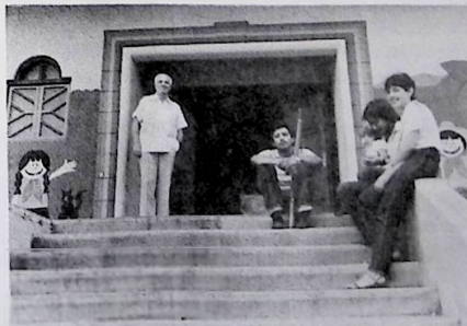
The Old Synagogue in Managua, Nicaragua. A Nicaraguan Jewish citizen is on the left. A guard and visitor are on the right.